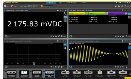
Figure 1. View measurements across USB DAQ, modular, and bench instruments all on one BenchVue interface.

The USB Modular DAQ App within BenchVue allows you to quickly configure and control any USB DAQ devices to perform data logging and visualize measurements. With six different display options, including grids and strip charts, zooming in to details the way you want is so much easier — so you can nail that measurement error in no time. You can also record measurements and export results to popular PC-friendly applications such as Microsoft Excel and Microsoft Word for further analysis in just a few clicks.